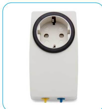
BJ-234 Enabler Socket+